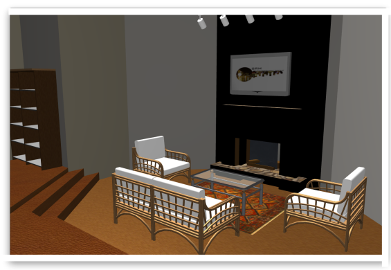
MASTER SUITE DEN